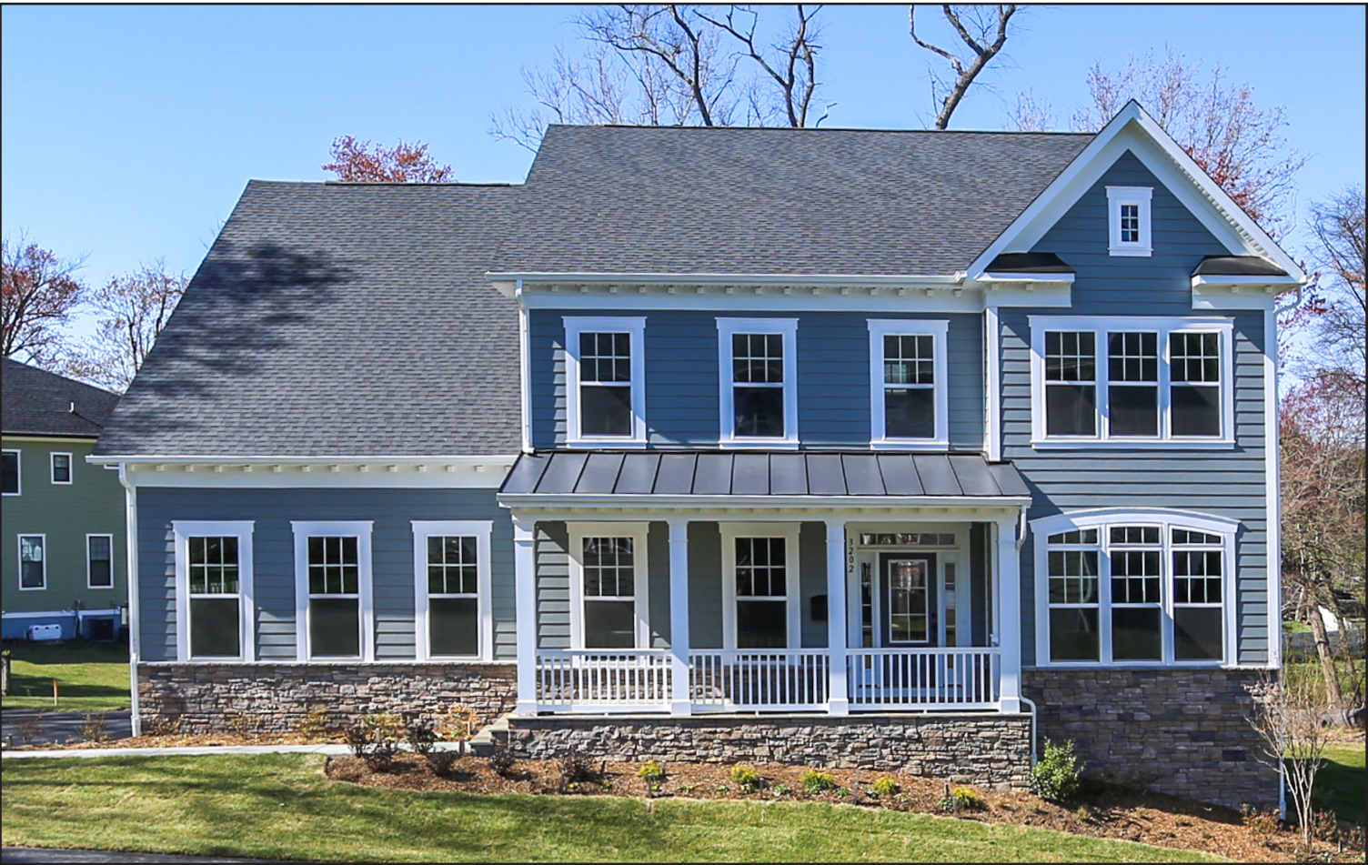
PICTURED: ELEVATION G WITH OPTIONS

GLENWOOD PLACE - HOMESITE 7B 3202 GLENWOOD PLACE, FALLS CHURCH, VA 22041