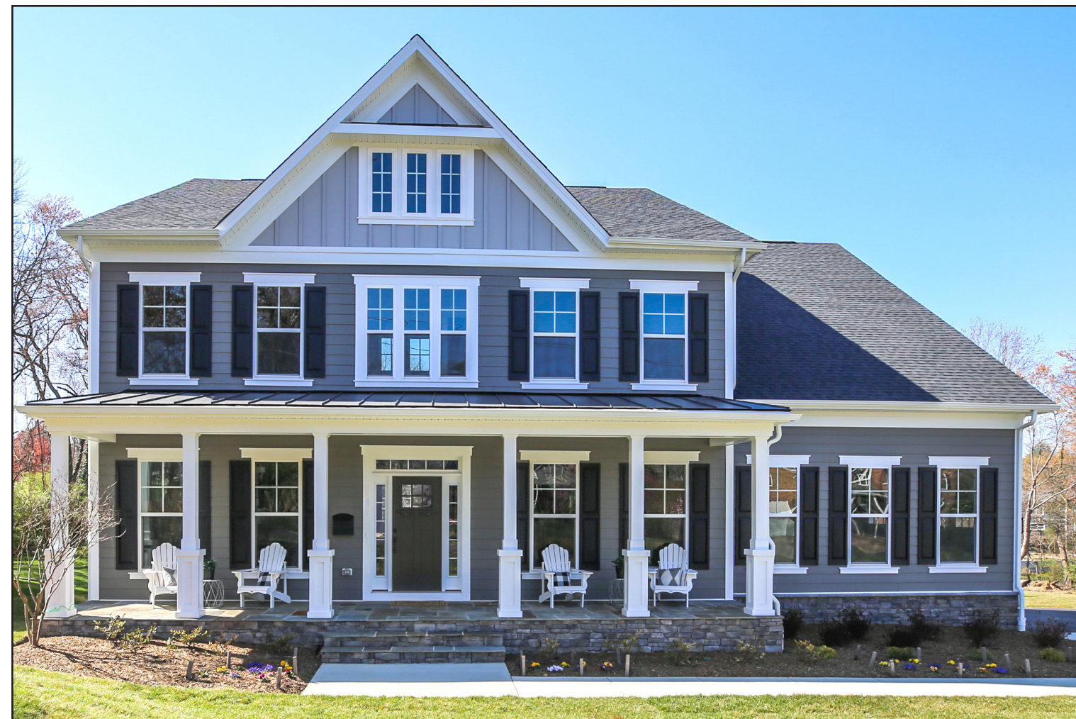
PICTURED: ELEVATION L WITH OPTIONS

APPROXIMATELY 6,800 SF STANDARD WITH 4 BD, 5.5 BA