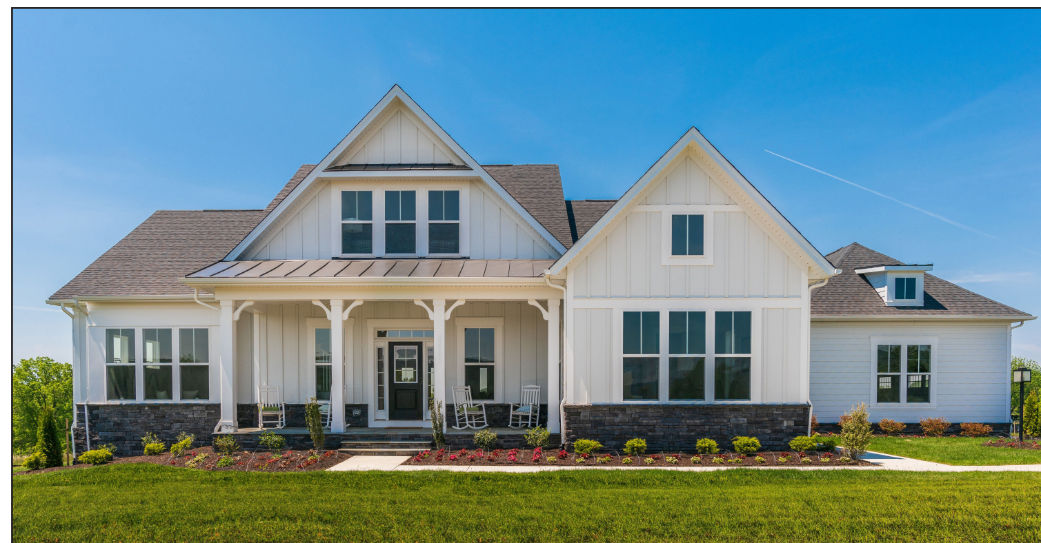
PICTURED: ELEVATION G WITH OPTIONS

APPROXIMATELY 5,800 SF STANDARD WITH 4 BD, 4.5 BA