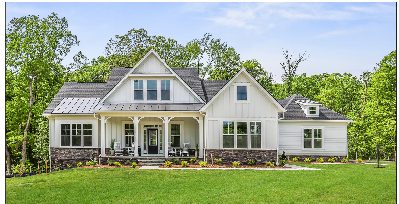
PICTURED: ELEVATION G WITH OPTIONS

APPROXIMATELY 5,800 SF STANDARD WITH 4 BD, 4.5 BA